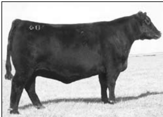
P C A R Everelda Entense 601 Reg +12743639 Granddam of Lots 48 & 50