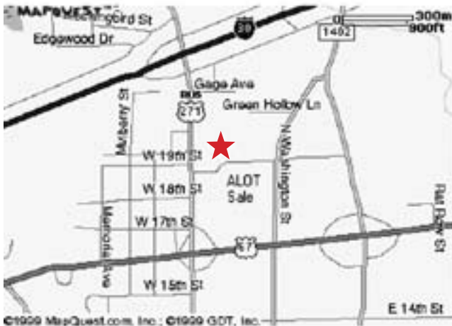
★ Titus County Livestock Pavilion, Mt. Pleasant, TX